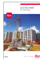
Leica Nova MS60