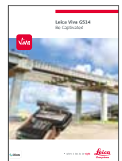
Leica Viva GS14