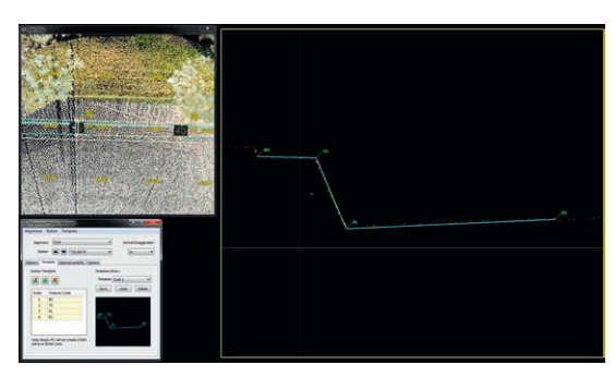
All new Alignment/Station Manager with a secondary Plan View window allows for easy creation of breakline from feature coded templates.