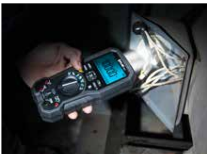
DM92 and DM93 feature powerful LED worklights